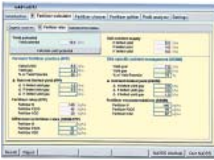
Figure 2. The NuDSS software module for calculating fertilizer N, P 2 O 5 , and K 2 O rates.

Fertilizer Splitter. Define or select a pre-defined splitting pattern for application suitable for the specific cropping season. Choose the fertilizer source that will provide needed nutrients.