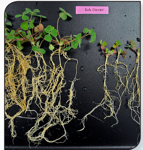
Poor nodulation and lower biomass production in sub clover due to aluminum toxicity/soil acidity.

Centre for Rhizobium Studies, Murdoch University